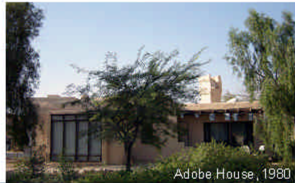
Adobe House, 1980