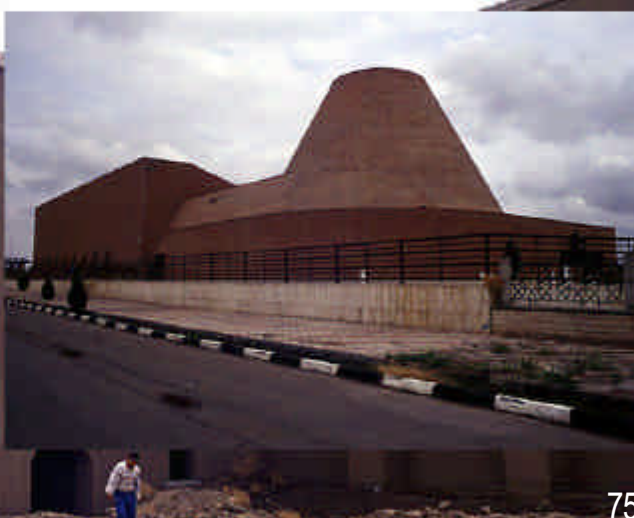
natural fridges ice houses