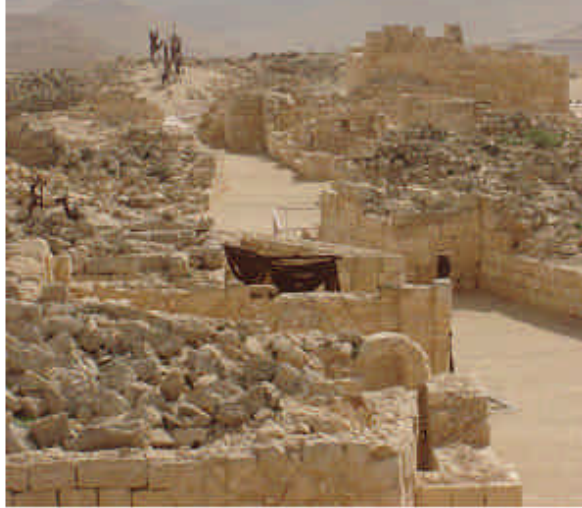
Ancient City Ovd dat (beginning of 300 BCE)

Nabateans who settled in Ovd dat (300 BCE) used to live with limited resources that desert offered. Run off water used to be harvested for agriculture at that time.