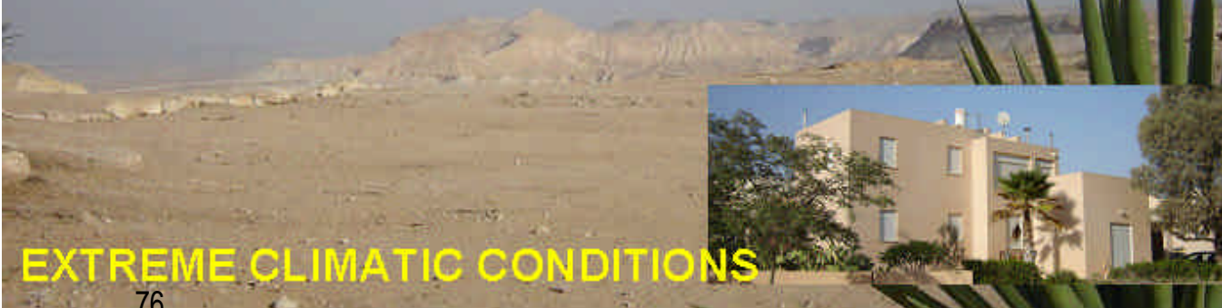
The Blaustein International Center For Desert Studies, 1990